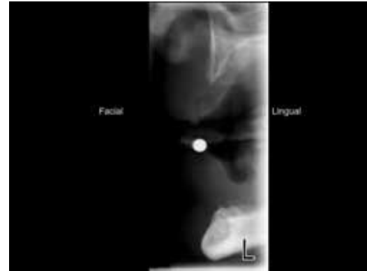
Fig. 1 – Minimal maxillary and mandibular bone quantity and quality for small–diameter implant placement as shown in a Planmeca tomographic radiograph. The radiopaque ball is 4 mm in diameter. The mandibular bone is Type D1, dense and very wide from facial to lingual, and the maxillary bone is Type D3, about 3+ mm from facial to lingual. Click here to enlarge image

Patients having the previously described bone characteristics – i.e., at least 3 or more mm of bone in a facial–lingual dimension and at least 10 mm of bone in an occlusal–apical dimension – are excellent candidates for SDIs (see Fig. 1).