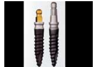
Fig. 5 – Spheres using “O” ring retention or tapered abutments for crowns are available from some companies. The designs shown are from IMTEC. Click here to enlarge image

Restoration of SDIs is no different from restoration of conventional–diameter implants. I have the following suggestions based on my own experience and observation of available research: