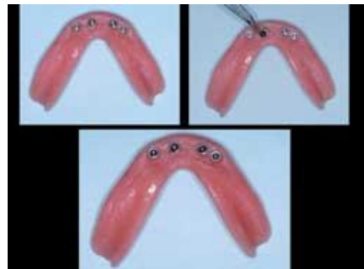
Fig. 3. – The “O” ring retained denture for the patient shown in Figs. 1 and 2. Click here to enlarge image