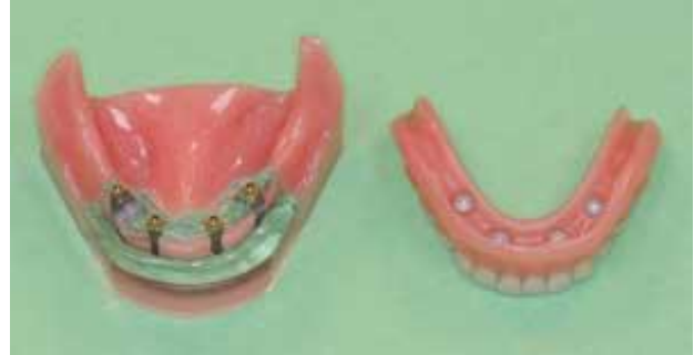
Fig. 4 – Example of Sterngold implants supporting ERA abutments. Bone must be of high quality to support such dentures Click here to enlarge image

Categories 1 through 4 have high success, and I do not resist suggesting their use when adequate bone is present. In my opinion, Categories 5 through 7 need additional research and observation. However, many dentists are using SDIs in Categories 5 through 7 with reported success, and I will use SDIs in these situations if there are no other viable alternatives.