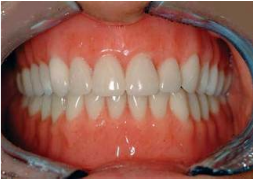
Figure 3 -- Dentures seated in the mouth, a few hours after implant replacement. Click here to enlarge image

Clinical success continues to be acknowledged with immediately loaded, small-diameter implants, and research is generally positive concerning this concept.