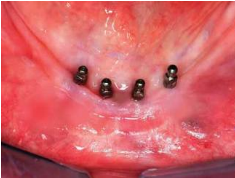
Figure 1 -- Four small-diameter implants (1.8 mm in diameter and 13 mm in length).