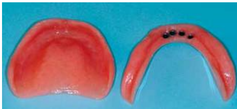
Figure 2 -- Patient's original dentures, released to contain housings for support and retention of lower denture.

Yes, these small-diameter implants can be loaded as soon as they are placed. Unlike conventional-diameter, root-form implants that are nearly 4 mm in diameter and require a hole nearly the size of the implant for insertion, the current generation of small-diameter implants are much like a screw for a hardwood board. A small, narrow-diameter osteotomy is made in the bone about one-third to one-half the anticipated depth of the mini implant, and the small-diameter implant is screwed into the bone. The bone is expanded and widened by the implant as it cuts its way deeper than the original osteotomy site. The result is a very stable small implant immediately on placement.