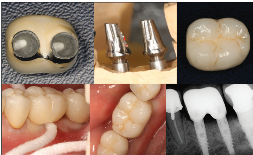
Fig. 1. Replacement of a molar with 2 narrow dental implants. a , A missing first left molar with a mesiodistal distance of 11 mm (upper view) was replaced with 2 narrow diameter dental implants (lower view). b , The final rehabilitation consisted of a crown with an artificial intraradicular space (upper view—laboratory work). Note the final restoration in place where broad floss is inserted for cleaning the area in an intraradicular manner (lower view left). Final radiographic view is presented in the lower right view.

Single regular-diameter implants might be incapable of predictably withstanding molar masticatory function and occlusal loading forces. Wide-diameter implants are a suitable alternative for replacing a missing molar in some cases; however, the use of 2 implants has been successfully demonstrated to be a functional and more biomechanically sound method of molar replacement. 15 Wide-diameter implants are not always a treatment option for replacing a single molar, especially when the buccolingual dimension is deficient. The use of 2 implants might also provide better prosthetic stability and prevent rotational forces on the prosthetic components. Restoration of missing molars