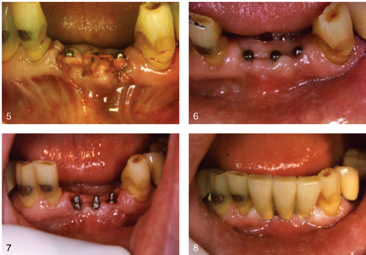
FIGURES 5-8. FIGURE 5. The acellular dermal graft was sutured under the gingival flap to close the site and contain the particulate bone allograft material. FIGURE 6. The site healed uneventfully. FIGURE 7. The percutaneous portions were slightly prepared for parallelism and impressed for splinted fixed partial denture construction. FIGURE 8. The final prosthesis was cemented with zinc phosphate cement.

suture (Vicryl, Ethicon, Somerville, NJ) (Figure 5). Initial implant stability was attained. The patient was orally administered 1000 mg amoxicillin and prescribed amoxicillin 875 mg twice a day and chlorhexidine oral rinses twice a day. Pain was controlled with 600 mg of orally administered ibuprofen as needed.