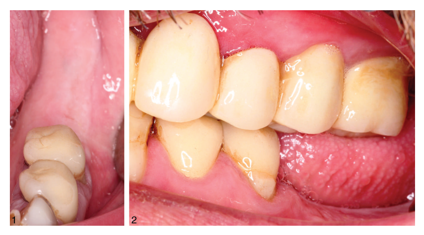
FIGURES 1 AND 2. FIGURE 1. The patient presented with an edentulous mandibular left. FIGURE 2. There was loss of vertical bone.

esthetics (Figure 5). After the patient's approval, the definitive splinted crowns were cemented with resin cement (Maxcem Elite, Kerr) (Figure 6). The tissue level zirconia margins are kept clean with daily