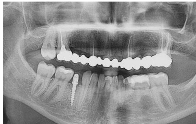
Figure 11 Panoramic radiograph after treatment completion.