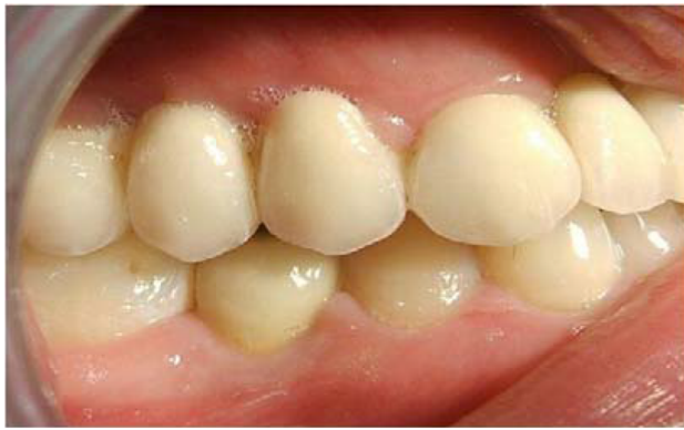
Figure 12 The small diameter implant-supported crown in function.