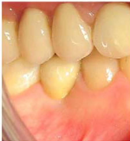
Figure 13 The small diameter implant-supported crown in function after 4 years.

not be placed until skeletal growth is complete. 40 The implants may stabilize and maintain the osseous ridges. 40 The goal of treatment is to improve function and provide an esthetic outcome. 40 Poor alveolar development, a larger number of missing teeth, and the morphology and position of the teeth that did develop complicate the management of treatment. 40