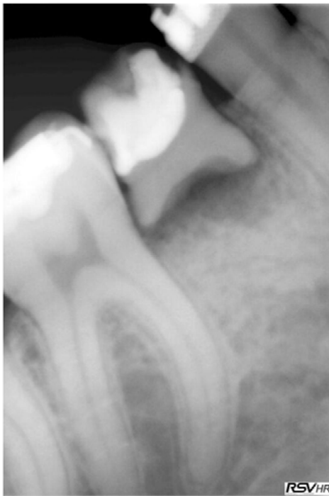
Figure 3 The unrestorable carious and exfoliating mandibular second deciduous molar.

First, carious deciduous teeth were extracted, the maxillary lateral incisors, and right second molar and left first molar and the mandibular right second molar (Figure 4). The maxillary right first premolar was extracted due to coronal caries and radicular malformation. The mandibular left first premolar had a malformed root but was left in place. The mandibular second premolar was absent due to agenesis. The overlying deciduous second molar was slightly submerged. Orthodontic treatment was then instituted over a 7-year period at the Department of Orthodontics, University of Genoa, Italy, without complications (Figures 5 and 6).