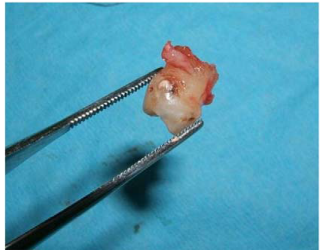
Figure 4 The unrestorable carious and exfoliating mandibular second deciduous molar was extracted.

The mandibular right second premolar site had healed well (Figure 7). This implant was planned to be placed flaplessly. A 2.5×13 mm SDI (MDL Intra-Lock International®, Boca Raton, FL, USA) was selected and placed according to SDI guidelines. 48 An osteotomy was performed with a 1.2 mm drill