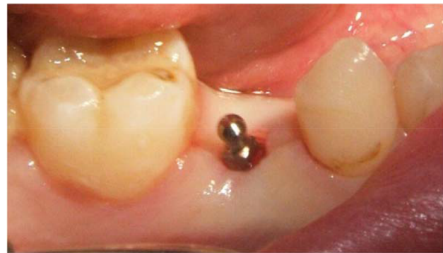
Figure 10 The implant after integration.