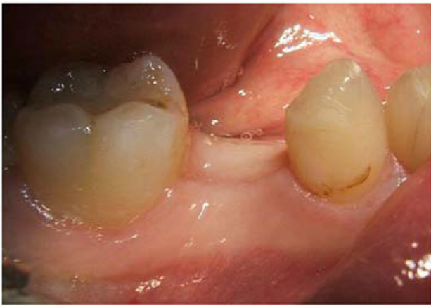
Figure 7 The healed site.