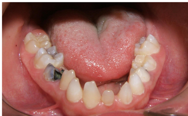
Figure 2 Mandible of the ectodermal dysplasia patient.