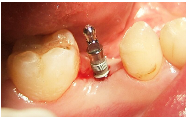
Figure 8 The small diameter implant was placed at 12 rpm and water cooled during seating.

assessed, and definitively cemented with Cement-Over™ Abutment (Intra-Lock International) (Figures 11 and 12). The crown has been in uneventful successful function for 4 years (Figure 13).