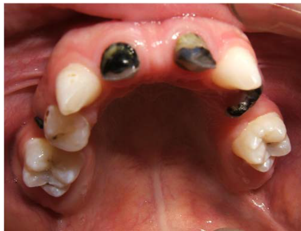
Figure 1 Maxilla of the ectodermal dysplasia patient.

A 20-year-old female affected by EDD presented with a chief complaint of a painful, mobile, and carious mandibular right second deciduous molar. Extraoral examination revealed hypotonicity of the perioral musculature. Her hair was thin and sparse. Her skin was dry, prone to rashes and easily sunburned. A medical consultation was made but no genetic testing was obtained on this patient, so a specific diagnosis type could not be made. The oral examination disclosed carious deciduous teeth and oligodontia (Figures 1–3). On the right side, missing permanent teeth were the maxillary second and third molars, second premolar, central and lateral incisors, left premolars, and second and third molars. In the mandible missing teeth were the right third molar, second premolar, left third molar and second premolar, and central incisors. Eleven teeth were absent from agenesis. The mandibular incisors were incompletely developed (Figure 2). Multiple carious deciduous teeth were deemed hopeless (Figures 1 and 2). After a discussion and informed consent was obtained from the patient to have the case details and any accompanying images published, implant treatment was decided upon.