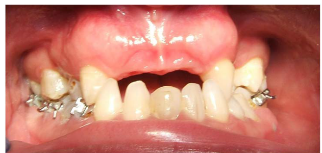
Figure 6 Orthodontic treatment was instituted.

sited equidistantly between the premolar and first molar and the center of the ridge crest. During osteotomy, a qualitative assessment of type 3 bone was made. The implant was then seated at 12 rpm and water cooled to prevent any significant insertion heat (Figures 8–10). An impression was done at insertion appointment and fabricated during the osseointegration time. After 3 months, a low cusp ceramic crown was inserted,