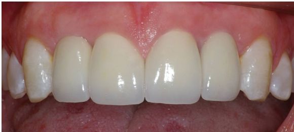
Figure 8: Retracted frontal view of final restorations