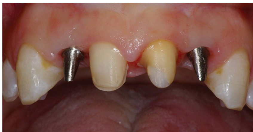
Figure 4: Preparation of teeth and implants

and maxillary centrals prepared, a temporary plastic snap cap was placed on the one-piece abutments and a polycarbonate provisional created from a wax-up was relined over the temporary caps and finished outside of the mouth using acrylic burs (Komet® USA). The immediate temporary was cemented using TempBond® Clear™ (Kerr) (Figure 5).