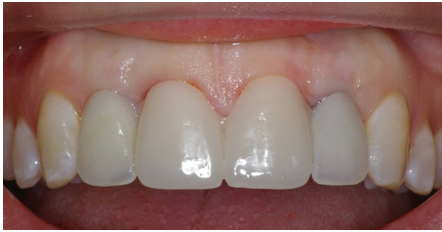
Figure 5: Provisional restoration