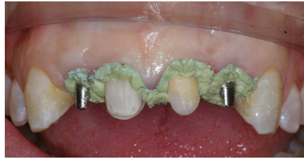
Figure 6: Retraction using Expasyl™