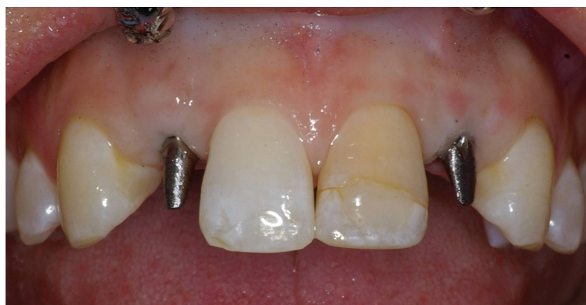
Figure 3: Preparation of implants