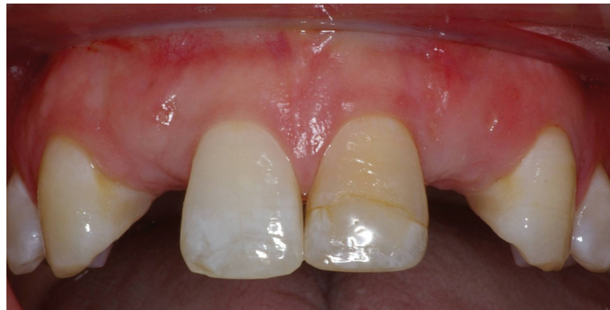
Figure 1: Retracted frontal view of area (pre-treatment)

A young patient in her mid 30s presented to my practice for replacement of her congenitally