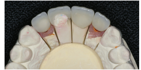
Figure 7: Lab work on restorations