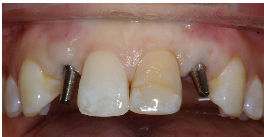
Figure 2: Placement of 3 mm x 14 mm I-Mini™ OCO Biomedical dental Implants

After the 3 mm x 14 mm I-Mini™ OCO Biomedical implants were placed