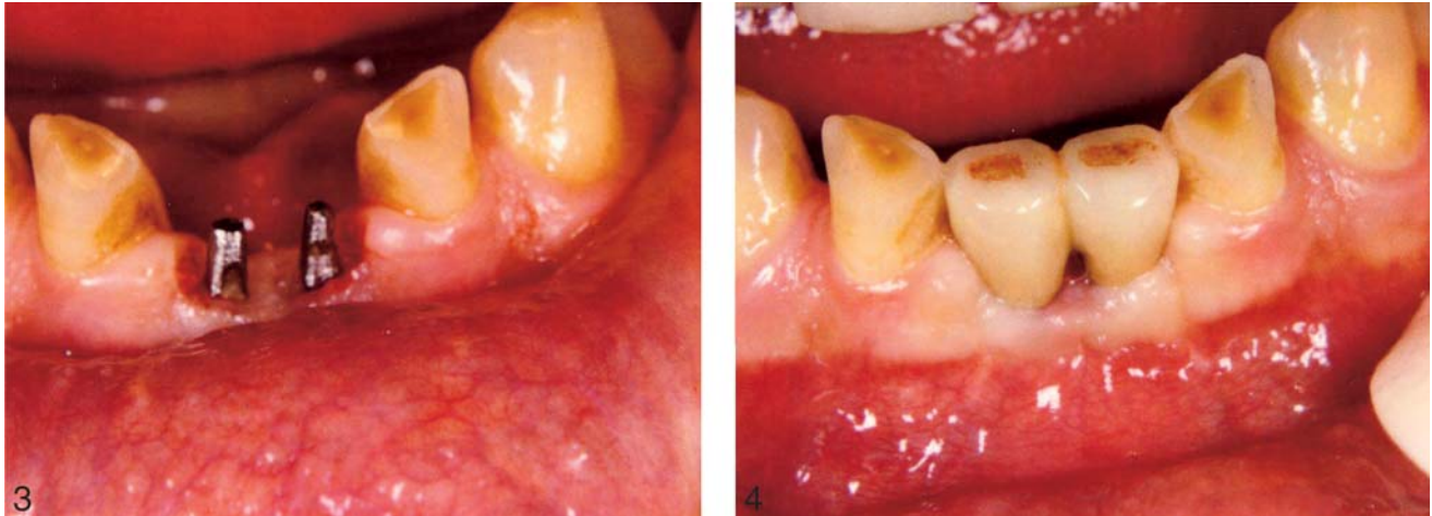
FIGURES 3–4. FIGURE 3. Slightly prepared coronals. FIGURE 4. Cemented prosthesis in place.

the prosthesis with no complications for 2 years (Figure 4).