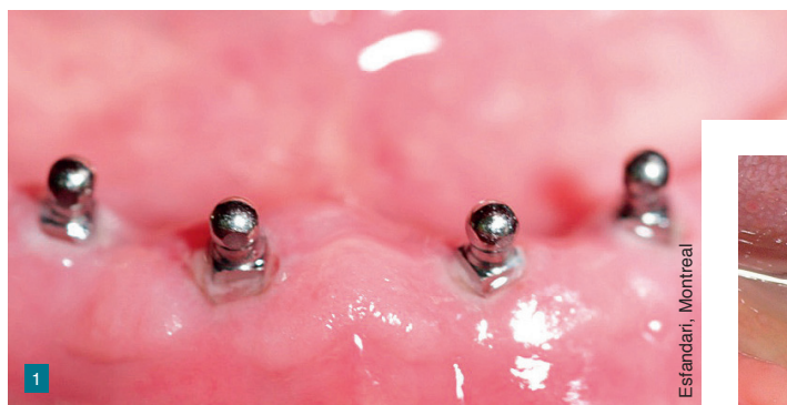
1: Clinical example: Four MDI mini-dental implants were placed in the lower jaw of this patient to anchor a full denture and provide improved denture support. 2: Determination of the stability of a mini-implant with Periotest classic